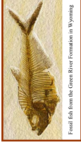
Fossil fish from the Green River Formation in Wyoming