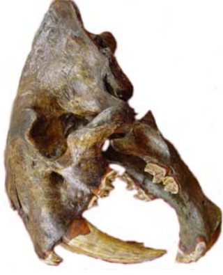
Saber cat skull from the La Brea Tar Pits, California

We will do any presentation or combination of presentations that you want. They will all stand alone or all work together.