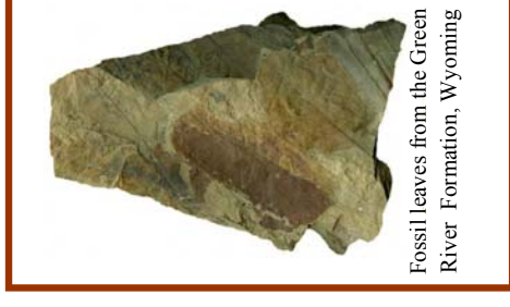
Fossil leaves from the Green River Formation, Wyoming

Creation is defensible by science. It would be a greater miracle for something to have been made by nothing because there had to be the same amount of miracles take place for us to exist, whether God made everything or everything made itself.